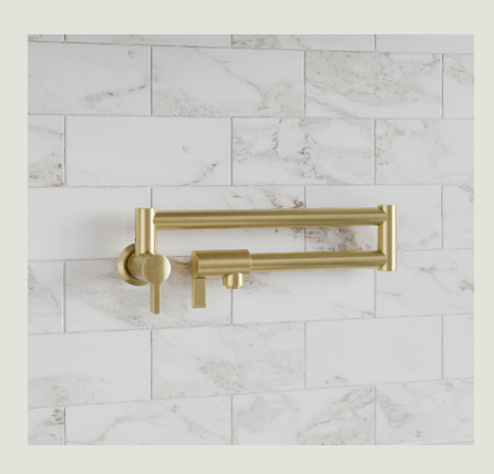
ARTE Single hole wall-mounted pot filler with two handles