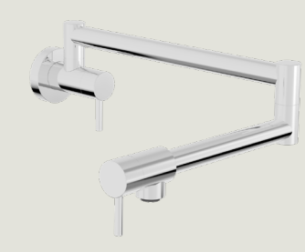
UNICK Single hole wall-mounted pot filler with two handles